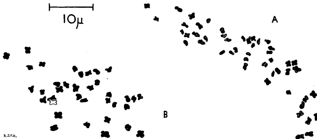
FIG. 2. Mitotic chromosomes in root-tip squashes of Lantana montevidensis . A, wild form, 2n = 48 ; B, garden form, 2n = 36 .